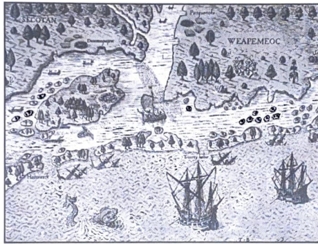
Roanoke: Arrival, 1590.

Remarkably, the English kept coming – men, women, and children. The vast majority