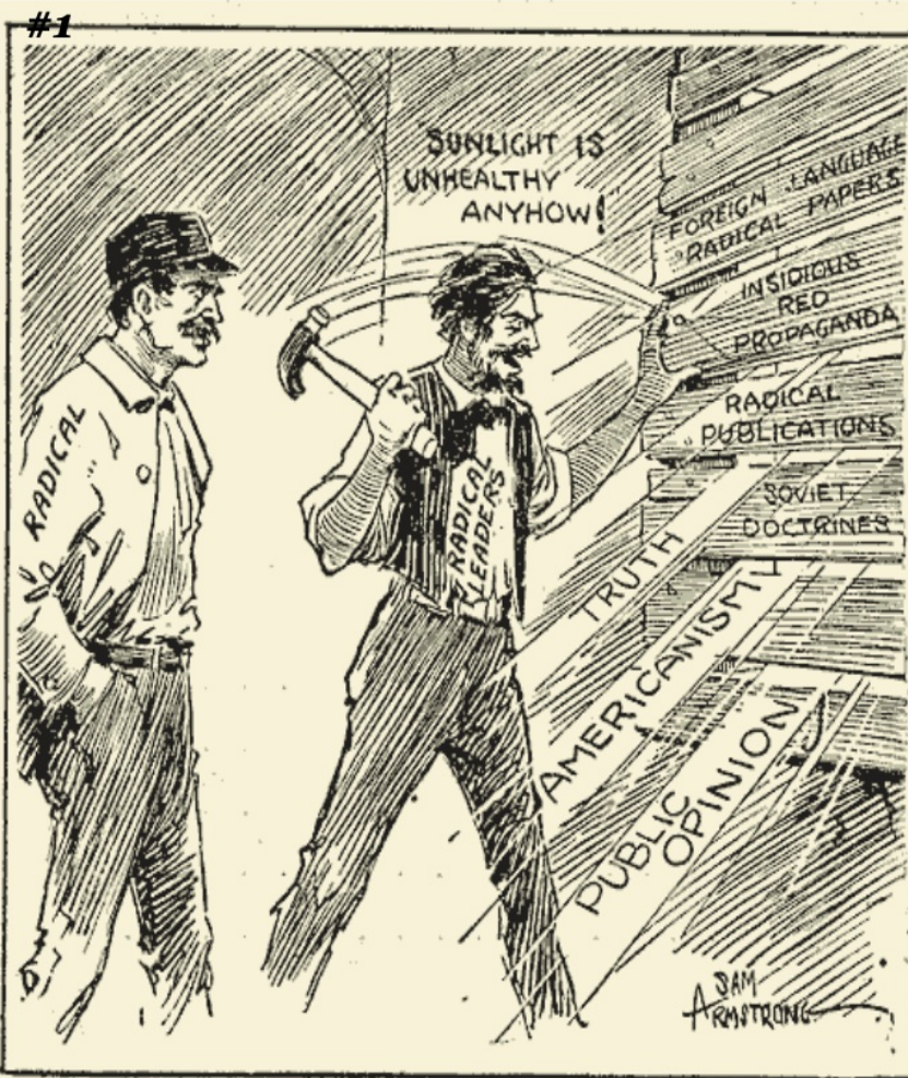
SHUTTING OUT THE LIGHT.

Prompt: 1. How do these images represent the role that the Press played in attacking the growth of Socialism/Communism in the United States during the 1920s? 2. How did these cartoons contribute to the atmosphere, or mood, of the American public that led to the wrongful conviction, and execution, of Sacco and Vanzetti?